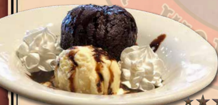
Chocolate Eruption Cake

Macaroni and Cheese ..... $2 49 Mashed Potatoes ..... $2 49 Homestyle French Fries ..... $2 49 Baked Potato ..... $2 99