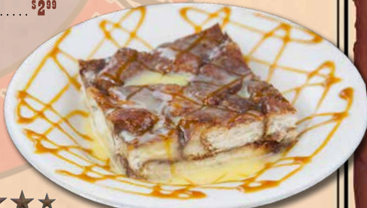
Risky's Famous Bread Pudding